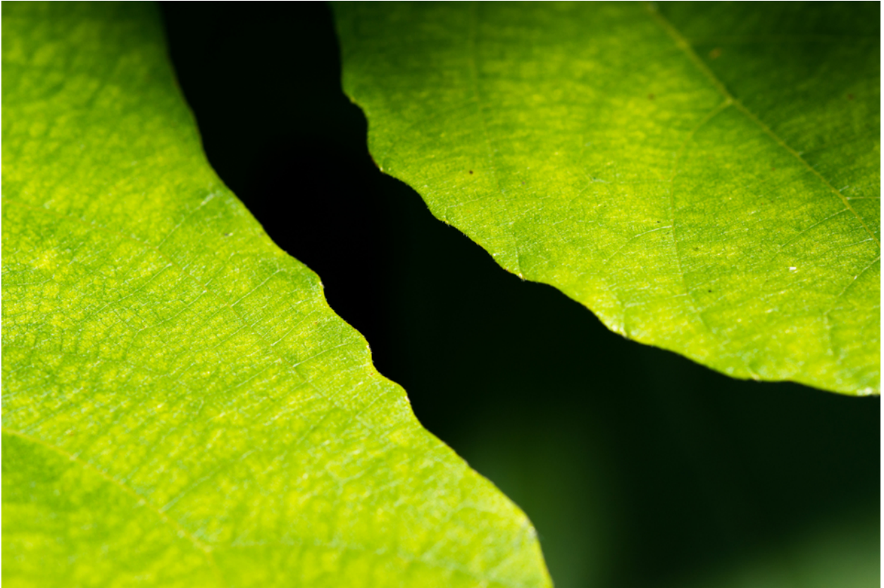
Fig Leaves III